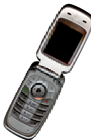
Fig. 2 Example of an unacceptable low-resolution image

Figures must be numbered using Arabic numerals. Figure captions must be in 8 pt Regular font. Captions of a single line (e.g. Fig. 2) must be centered whereas multi-line captions must be justified (e.g. Fig. 1). Captions with figure numbers must be placed after their associated figures, as shown in Fig. 1.