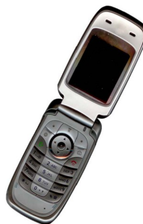
Fig. 3 Example of an image with acceptable resolution